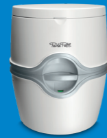
Porta Potti 565

The Porta Potti is a closed sanitation system which is compact and light weight. You can place the portable toilet pretty much anywhere. Porta Pottis are often used in folding tents, tents, camper trailers and boats. They can also come in handy during house renovations, summer or garden houses. They can be placed in any room at home and are suitable for all ages, even if you are less mobile.